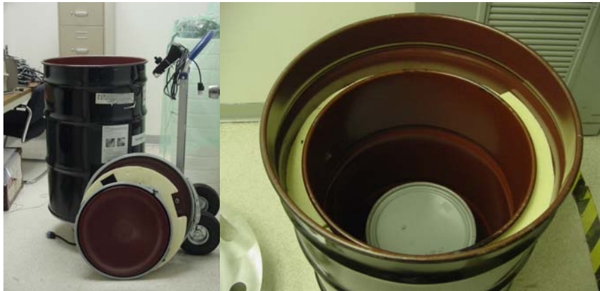
Figure 1. Drum on counting turntable (left) and item in 30-gal/55-gal drum-in-drum configuration.

Figure 1 shows the side-view of the 55-gallon drum on the assay turntable and the top view of the 30-gallon drum inside the 55-gallon drum. The prohibited assay item is inside the 5-gallon container shown inside the 30-gal/55-gal drum-in-drum configuration.