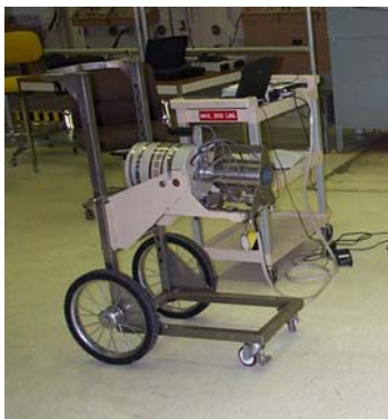
Figure 2. Isocart system used for the analyses.

The calibration of the detectors used for this method is described in technical report “Nondestructive Assay Efficiency Calibration of HPGe Detectors for the Ortec Isotopic Method”, WSRC-TR-2005-00431. The HPGe detector was calibrated using a NIST-traceable mixed-gamma-ray point source obtained from Analytix, Inc. with certified gamma-ray emission rates for the radionuclides in the standard with overall uncertainties of 2.6 to 3.3% in the energy range from 59 keV to 1836 keV. The point source was positioned in the inner drum where the prohibited item is placed and at various distances (4, 12 and 36 inches) from the face of the high purity germanium detector and this efficiency data was then input into ISOTOPIC. ISOTOPIC makes additional corrections to account for differences in the geometry of the prohibited item and container and in attenuation between the calibration point-source standard and the object being measured.