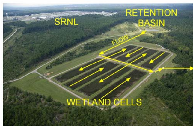
Layout and flow path through CWTS for A-01 outfall.

The CWTS for A-01 outfall is composed of eight one-acre wetland cells connected in pairs as treatment units. They were planted with giant bulrush ( Schoenoplectus californicus ) to provide continuous organic matter input,