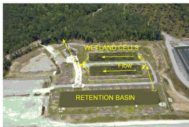
Layout and flow path through CWTS for H-02 outfall.

Routine monitoring samples for water quality are collected at a compositing sampler at the compliance point for monthly reporting. As part of the research effort, monthly grab samples are collected from numerous other locations from the inflow to the system through the discharge to the receiving stream. Water samples