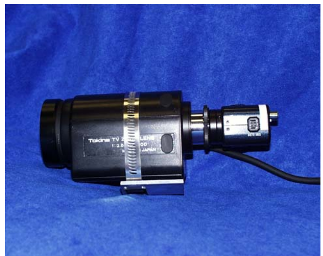
Figure 1: Standard CCD Camera and Lens Assembly

Each chemical separations plant building is an 835-foot long, multilevel facility and is referred to as a “canyon” because of its long, rectangular shape. Radioactive operations are performed inside two parallel smaller canyons, referred to as “Hot” and “Warm” canyons indicating the levels of radiation within them. The radiation rates inside portions of the canyon are lethal at a close distance. The Hot and Warm Canyons each house a series of cells with concrete walls and cell covers,