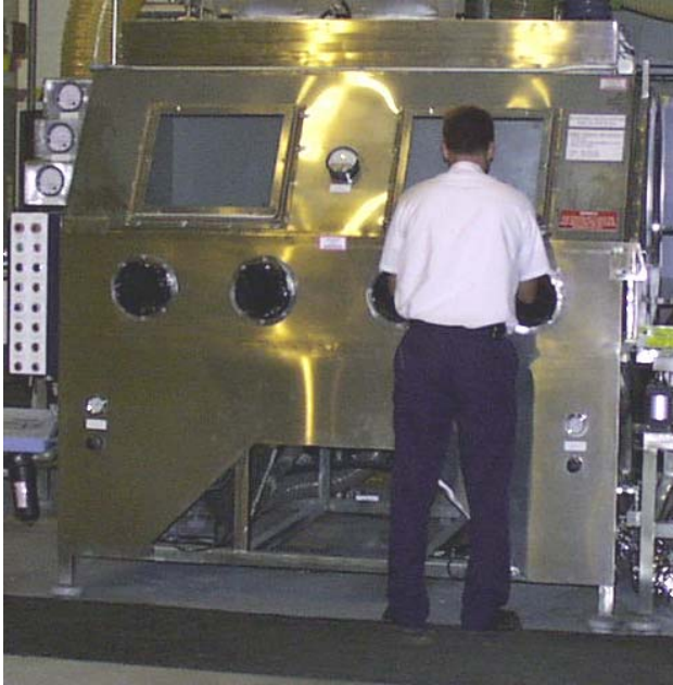
Figure 8: Typical Glovebox