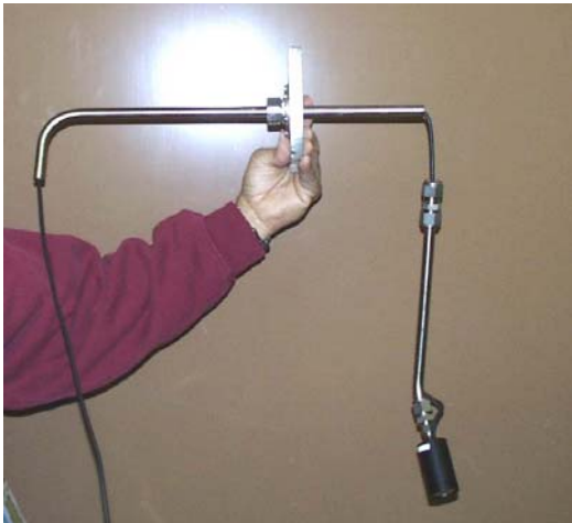
Figure 9: Glovebox Camera Assembly

sections are assembled inside the glovebox, and the camera head is lowered into the tank.