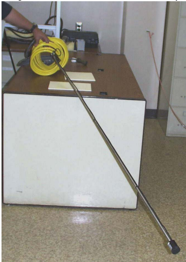
Figure 5: Tank Interior Inspection Assembly

developed for viewing inside tanks that contains a Microvideo MVC-2120-WP-LED waterproof camera assembly with built-in LED's. This assembly is hung from the crane hook and lowered down into cells or tanks.