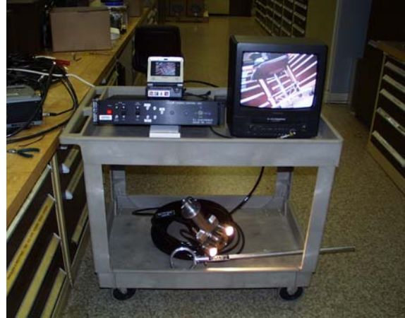
Figure 10: Basin Inspection System

One of the current missions of SRS is the safe receipt and interim storage of spent nuclear fuel (SNF) assemblies from SRS reactors and from domestic and foreign research reactors. These fuel assemblies are handled and stored underwater in large indoor basins to provide shielding to prevent personnel exposure to radiation. Routine inspections of all assemblies are required, and the identification numbers of newly received assemblies must be verified.[6] Because the assemblies are underwater, a waterproof pan-tilt-zoom video system supplied by RJ Electronics is used (Figure 10). The system is suspended from an overhead crane