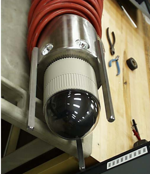
Figure 4: Pan-Tilt-Zoom Dome Camera Assembly

A third area of the canyons that must be viewed is vessel or tank interiors. Figure 5 shows a camera system