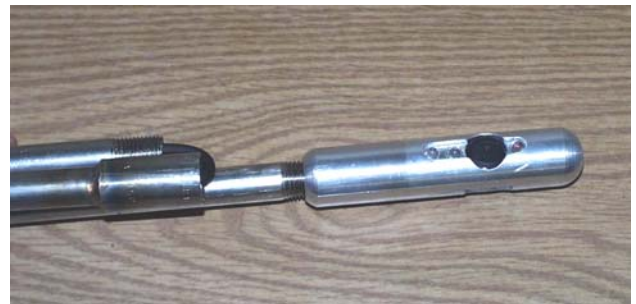
Figure 7: Isokinetic Probe Internal Inspection Assembly

Some operations at SRS that involve high levels of radioactive contamination but low levels of radiation are performed within gloveboxes (Figure 8). One SRS facility where operations are performed within gloveboxes is HB-Line. HB-Line is a chemical processing facility that was built to support the production of Plutonium-238 (Pu-238), a power source for deep space exploration. The HB-Line processes are performed in thin, rectangular tanks within the gloveboxes, and routine inspections of these tanks are required to maintain normal operations. [5] Installation of equipment inside a glovebox is a challenge because the glovebox containment must be maintained. Figure 9 shows a camera assembly developed for use inside a glovebox. The assembly is made in two sections to allow for easy insertion into the glovebox through a gloveport. The