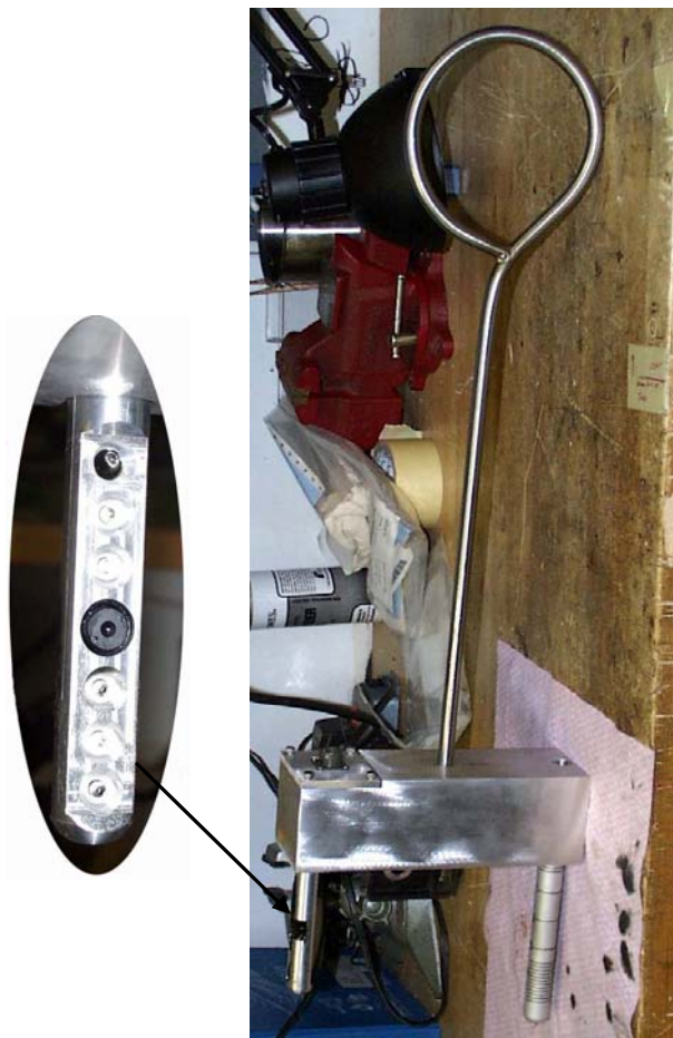
Figure 2: Remote Measuring Tool

In addition to the overview cameras on the cranes, specialized systems are developed as needed to accomplish specific tasks within the canyons. All systems are designed to be operated from the existing camera/lens controls in the crane control room. An example is a video assembly designed to perform remote measuring task of a fuel insert in support of nuclear fuel processing (Figure 2). One of the operations performed in