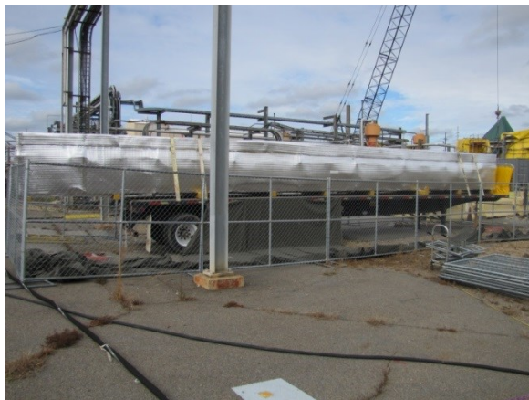
Fig. 8. SMP in long term cold weather storage

for another 6 years at a minimum, but these pumps required removal to provide tank access during the grouting phase. To date, no SLP has been required to be stored outside of a waste tank after use. However, contamination and shielding controls would be similar. Also, long shafted pumps require routine shaft rotation not available within storage containers.