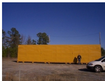
Fig. 7. SMP Pump Transport Container