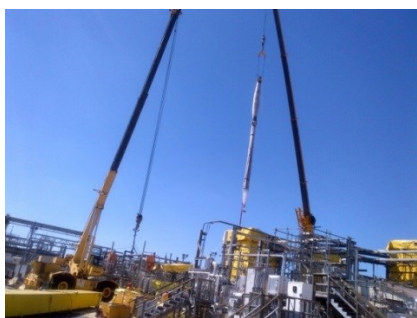
Fig. 6. Pump sleeved and clear of riser