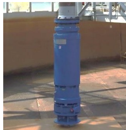
Fig. 3. CSMP

SLPs and SMPs have been developed, matured, and successfully used to perform waste removal within the Savannah River Site Tank Farms. As early as 2010, these pumps were the baseline for tank waste suspension and mixing for closure activities at SRS. SLPs have proven reliability and have the process flexibility to support most tank closure requirements. SMPs are higher capacity pumps which provide an adequate cleaning radius that requires the use of only 3 per tank versus 4 SLPs. The SMP’s hydraulic design and operational requirements typically increases the tank liquid level needed for long duration mixing campaigns and are not designed to operate for long periods of time in oxalic acid or in water which has been used in some tank closure campaigns as a means of final tank cleaning. Table 1 below provides specific pump details for the SLP and SMPs.