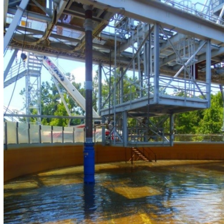
Fig. 9. CSMP installed in the TNX test tank

An example operational data graph and table below shows the run data during a ramp up/down, integral speed step, and continuous run in water over 9+ hours. Useful trends that can be pulled from these graphs are: