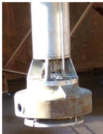
Fig. 1. SLP