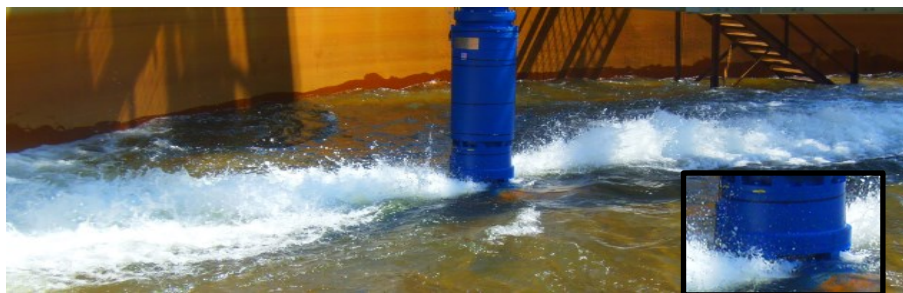
Fig. 12. Rooster Tailing during Testing at TNX

The operation of a mixing pump in a manner that results in “rooster tailing” is not allowed per the current SRS Tank Farm Documented Safety Analysis (DSA). This is to eliminate the potential to aerosolize waste during mixing in a waste tank. An evaluation was conducted to determine the levels and speeds the CSMP can run at without rooster tailing, the photo below is an example of the CSMP rooster tailing. The evaluation determined that the CSMP can run as low as 76.2 cm (30 inches) of submergence at full speed, at lower levels it should be run at 157.1 rad/sec (1500 RPM) or less, and the CSMP should not be run at all below 61.0 cm (24 inches) of submergence.