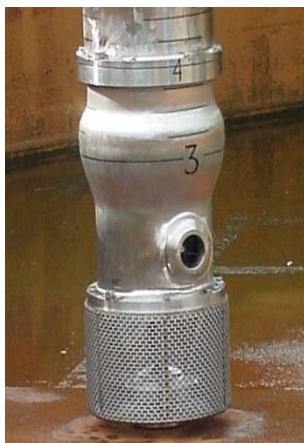
Fig. 2. SMP