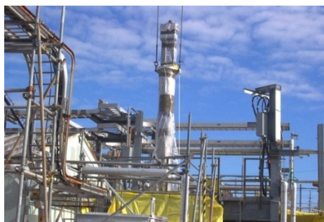
Fig. 5. Sleeving of pumps for contamination control