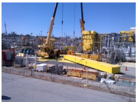
Fig. 4. Tank top hut, containment box, main and tailing crane.

Baseline planning includes relocation of mixing pumps from tank to tank as waste removal progresses through the tank farms. To date, this has only been successful between adjacent tanks where cranes can move the pumps between tanks in one lift, at a cost of $1.18M.[1] Both SLPs and SMPs have been successfully moved in one pick between adjacent tanks. General requirements include huts on each tank and pump sleeves for contamination control with critical crane lifts for pump relocation. For movement of pumps between tanks that are not adjacent, the scope and contamination controls are much greater. In addition to containment huts and pump sleeves, containment and transportation boxes are required. A second crane is also required to support pumps as they are placed on ground supports. A recent estimate to move one SLP between tank farms estimates the cost at $1.45M. For SMPs, the pump must be transported at a 5 degree slope after contamination since the vendor provided impeller locking device cannot be installed on a contaminated pump. Provided below is a summary of the scope required to relocate pumps by transportation.