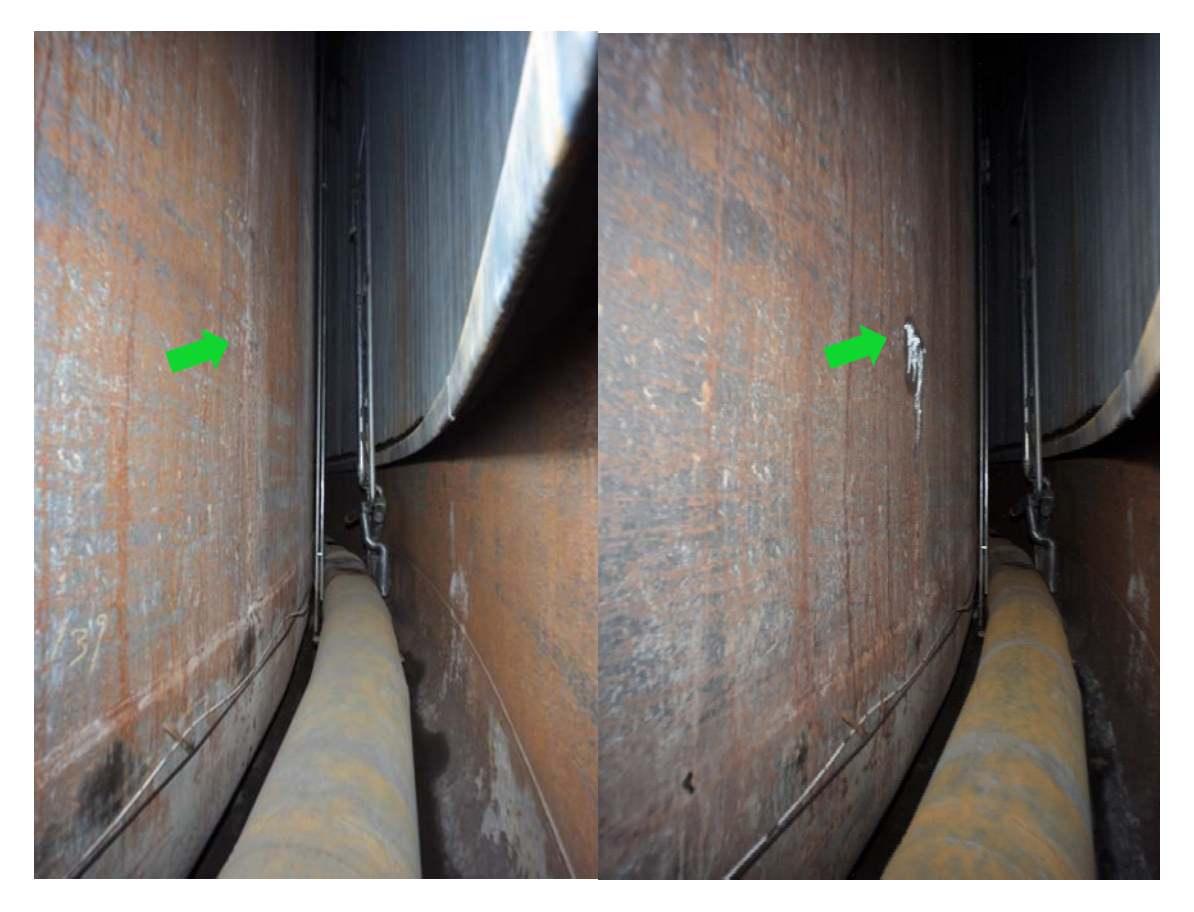
Figure 2. Known Leak Site Before and After Liquid Additions