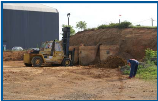
Figure 2. – Legacy TRU waste buried in culverts

The majority of the TRU legacy waste is either buried in concrete culverts and boxes or is stored in waste pads in various non standard metal or concrete boxes, see Figures 2 and 3. The waste packages range in size and content from 6 meter x 4 meter x 2 meter large steel boxes containing such items as process vessels, ducts, and large filters to 55 gallon drums containing various waste removed from processing glove-boxes. Within the culverts and boxes are waste drums and/or smaller crates that must be removed for further characterization.