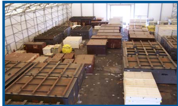
Figure 3. – Legacy TRU waste on waste pads