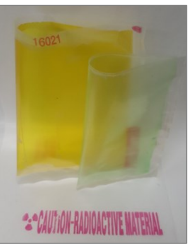
Polymer C60 nanocomposite films manufactured into nuclear materials disposal containers with greatly increased resistance to alpha radiation