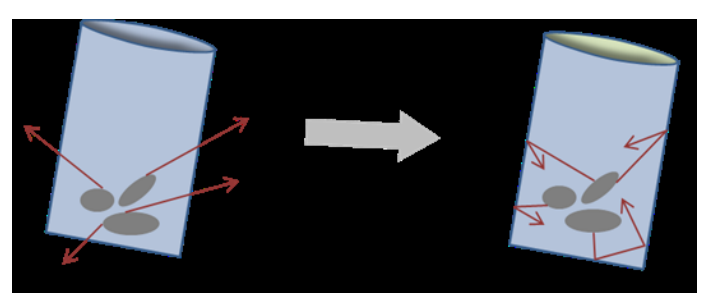
breakdown by radiation (left). Adding a polymer layer with embedded radiation-resistant particles prolongs the bags' function (right).

In one application, SRNL has bound the radiation-resistant polymer to commercially available linear low-density polyethylene (LLDPE) radiological waste bags, allowing significantly increased tolerance to alpha-particle-absorbed dose as compared to the standard LLDPE. This increase in absorbed dose tolerance also has shown to result in dramatically increased residence time of the polymer in high radiation environments, for an effective 13X increase in absorbed dose. These materials have shown to greatly slow degradation rates as compared to commercially available LLDPE nuclear materials disposal bags. In another application, SRNL has developed and tested several additives that can be used in the commercial extrusion process for LLDPE bags. The new polymer bags exhibit alpha/beta/gamma degradation resistance.