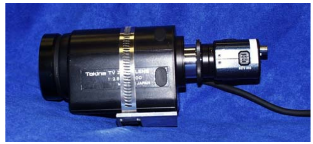
Figure 1: Standard CCD Camera and Lens Assembly

canyons indicating the levels of radiation within them. The radiation rates inside portions of the canyon are lethal at a close distance. The Hot and Warm Canyons each house a series of cells with concrete walls and cell covers, and all work is performed remotely from a central control room using bridge cranes. [3] Initially, an optical system similar to a periscope was used for remote viewing. Later, radiation-hardened systems, consisting of video cameras, zoom lenses, and pan-and-tilt devices, were installed on the crane, which improved the viewing capabilities of the operators by providing "bird's eye" views of the canyon. Each crane has eight to ten video systems. Within the past ten years, as radiation-hardened components failed, standard Genwac CCD cameras and Tokina zoom lenses were installed as replacements into the existing housings. This resulted in an estimated $400,000 cost savings for the initial camera replacement. Figure 1 shows the current camera and lens assembly.