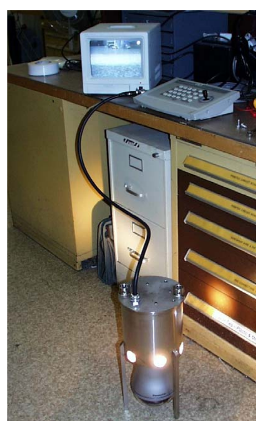
Figure 4: Pan-Tilt-Zoom Dome Camera Assembly with Joystick Controller and Monitor

A second type of specialized system for the canyons was developed to provide viewing around or beneath obstructions where the crane cameras couldn't see. The assembly contains a Panasonic pan-tilt-zoom "dome" camera with built-in multi-directional lights and standoffs to allow the assembly to be placed on the canyon floor (Figure 4). The "over-the-coax" method of control and video signal transmission was used so that only power wires and a video cable were required. An interface box was designed to enable operation from the existing controls in the central control room. The assembly is lowered into position by the crane, and the cables are either fed through coiled tubing around the crane hook or used in conjunction with a cable reel for cable management purposes. The cable management method used depends on the location.