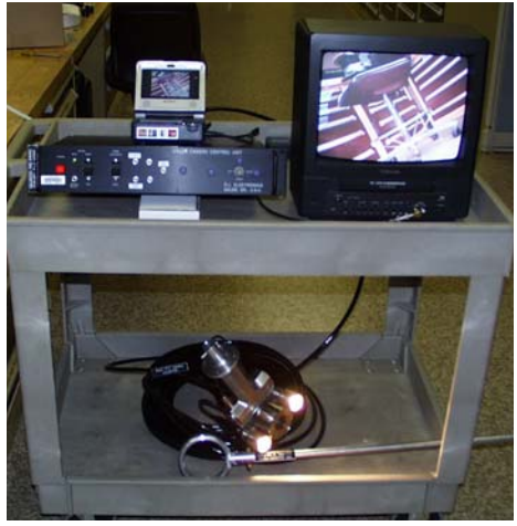
Figure 10: Basin Inspection System

One of the current missions of SRS is the safe receipt and interim storage of spent nuclear fuel (SNF) assemblies from domestic and foreign research reactors. These fuel assemblies are handled and stored underwater in large indoor basins to provide shielding and prevent personnel exposure to radiation. Routine inspections of all assemblies are required, and the identification numbers of newly received assemblies must be verified.[6] Because the assemblies are underwater, a waterproof pantilt-zoom video system supplied by RJ Electronics is used (Figure 10). The system is suspended from an overhead crane and is remotely controlled by an operator from a safe location. This system provides high-resolution, adjustable video images, and it has been used in many SRS applications.