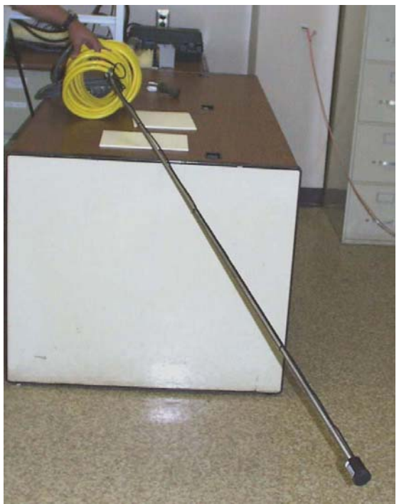
Figure 5: Tank Interior Inspection Assembly

Microvideo MVC-2120-WP-LED waterproof camera assembly with built-in LED's. This assembly is hung from the crane hook and lowered down into cells or tanks.