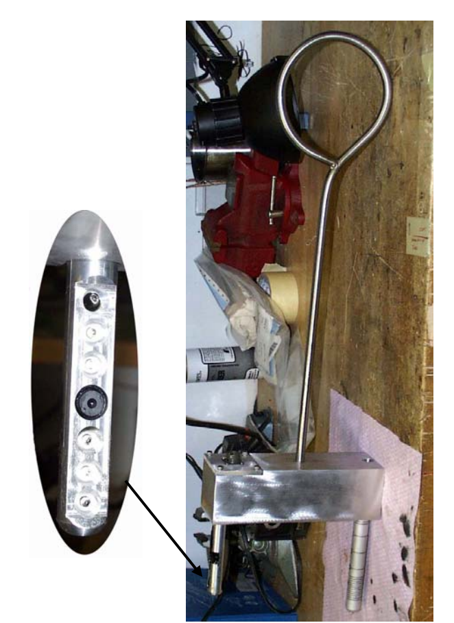
Figure 2: Remote Measuring Tool