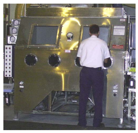
Figure 8: Typical Glovebox (non-radioactive)

Some operations at SRS that involve high levels of radioactive contamination but low levels of radiation are performed within gloveboxes (Figure 8). One SRS facility where operations are performed within gloveboxes is HB-Line, a chemical processing facility that was built to support the production of Plutonium-238 (Pu-238), a power source for deep space exploration. The HB-Line processes are performed in thin, rectangular tanks within the gloveboxes, and routine inspections of these tanks are required to maintain normal operations. [5] Installation of equipment inside a glovebox is a challenge because the glovebox containment must be Figure 9 shows a camera assembly maintained. developed for use inside a glovebox. The assembly is made in two sections to allow for easy insertion into the glovebox through a gloveport. The sections are assembled inside the glovebox, and the camera head is lowered through a 2" OD port into the tank. An operator can then manually rotate the camera to view the entire tank interior.