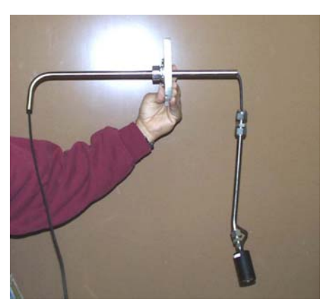
Figure 9: Glovebox Camera Assembly