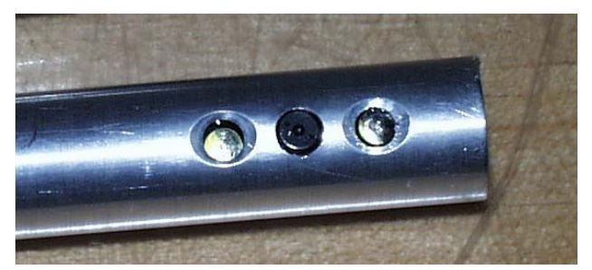
Figure 7: Isokinetic Probe Internal Inspection Camera/LED Assembly

camera used was a Supercircuits PC208 camera.